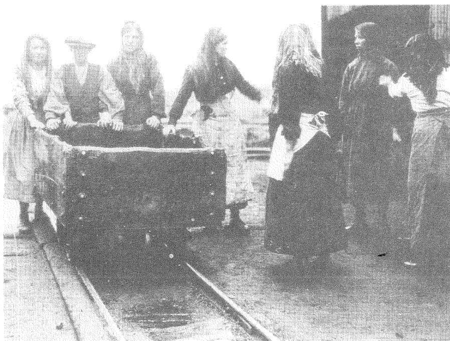
Bald worked tirelessly to improve the oppressive lives of miners, particularly women and children, and drove important government reforms.

~ For mere pennies a day each woman pushed, pulled or carried tubs of coal weighing as much as 200 pounds more than 100 yards up steep tunnels and/or stairs to the pithead. ~