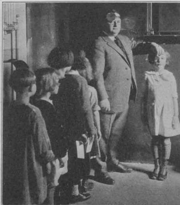
PHYSICAL EXAMINATION BY SPECIALISTS

The physical welfare of the group is in the hands of