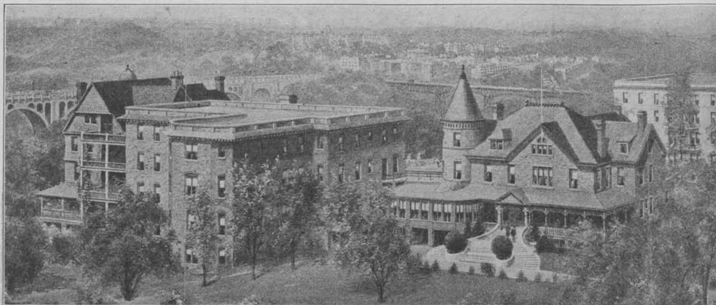
THE NATIONAL CATHOLIC SERVICE SCHOOL FOR WOMEN IS THE NATIONAL WORK OF THE N. C. C. W.

Three splendid buildings located in the heart of Washington, D. C., at 2400 Nineteenth St. N.W., comprise the school's physical plant