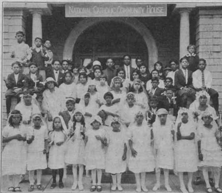
CLASS PREPARED FOR FIRST COMMUNION AT THE CATHOLIC COMMUNITY HOUSE, SAN ANTONIO, TEXAS