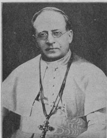
HIS HOLINESS, POPE PIUS XI