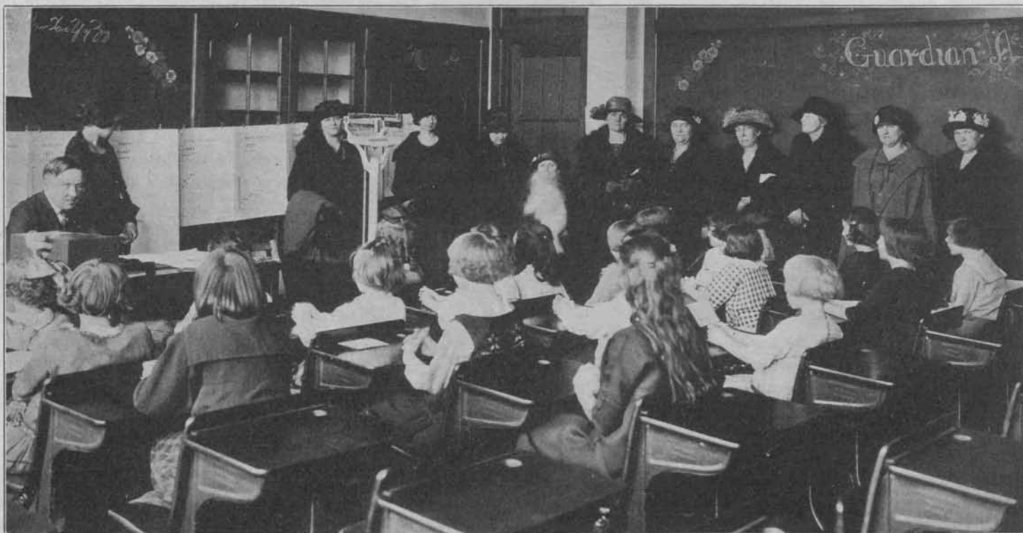
NUTRITION CLASS FOR UNDERWEIGHT GIRLS

Ideal ingredients for effective health teaching: Children, parents, teacher and physician. This class meets weekly at Holy Trinity School, Washington, D. C.